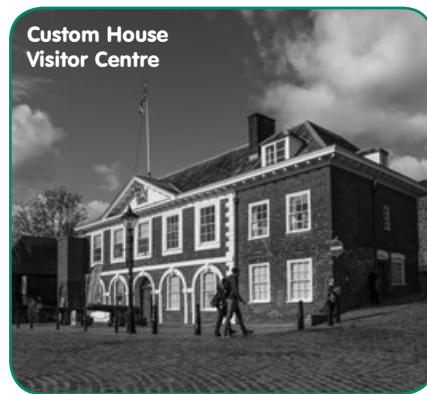
Custom House Visitor Centre

Please note, all prices include VAT at 20% and may be subject to change.