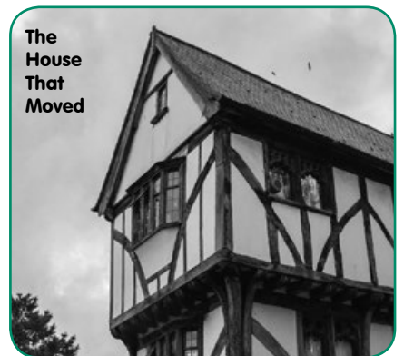
The House That Moved